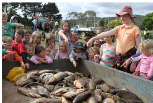
Young Numerellians surveying their catch

There was a total of 145 fish caught over the weekend with about 300 fingerlings. The total weight for all of the fish caught this year was 163.98kg.